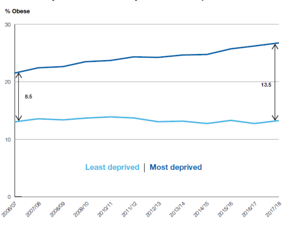
10-11 year olds, by area deprivation