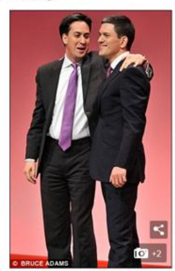
Older Miliband brother David, right, was tipped to be the Labour party leader but was pipped to the post by younger brother Ed

'This means that children from more deprived backgrounds benefit more from a high attaining older sibling than children from more affluent backgrounds.'